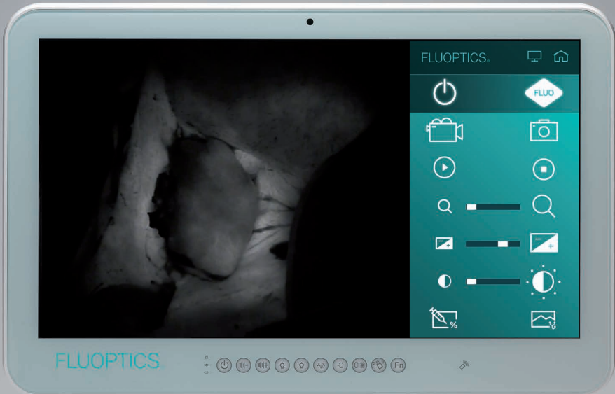
Perfused free flap visualization