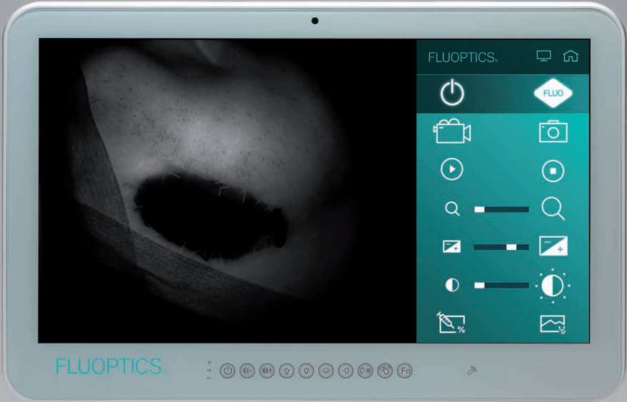
Non-perfused free flap visualization